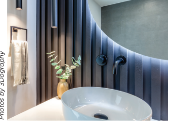
The bathroom was designed and constructed by Shawn Tokan, Heather's husband and the person behind the construction side of the Tokan Construction and Design.